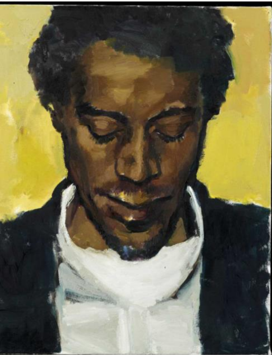
Yvette Yiadom-Boakye One by the Ounce 2014 Yvette Yiadom-Boakye