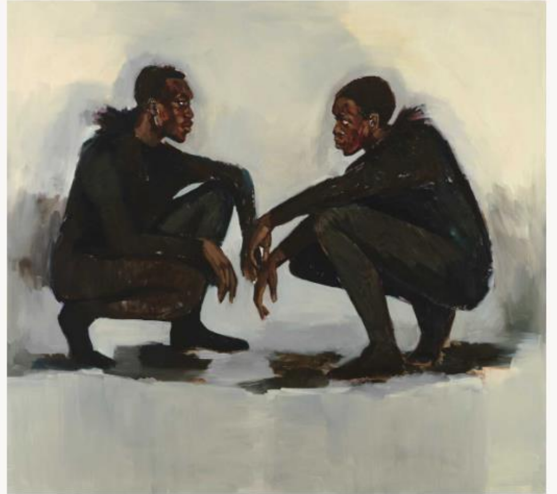
Lynette Yiadom-Boakye No Need Of Speech 2018 Carnegie Museum of Art (Pittsburgh, USA) © Lynette Yiadom-Boakye

MANY OF THE PEOPLE IN THESE PAINTINGS ARE NOT WEARING SHOES? LYNETTE YIADOM-BOAKYE RECKONS THAT SHOES TELL YOU TOO MUCH ABOUT A SPECIFIC PERIOD IN TIME. SHE DOESN'T WANT THE PEOPLE IN HER PAINTINGS TO BE TIED TO ANY ONE TIME PERIOD OR PLACE! SOME PEOPLE THINK THE PEOPLE IN HER PORTRAITS LOOK LIKE THEY'RE WEARING FANCY DRESS! WHAT DO YOU THINK? WHAT SHOES OR CLOTHES WOULD YOU CHOOSE TO WEAR IN A SELF-PORTRAIT? WHAT WOULD THEY SAY ABOUT YOU?