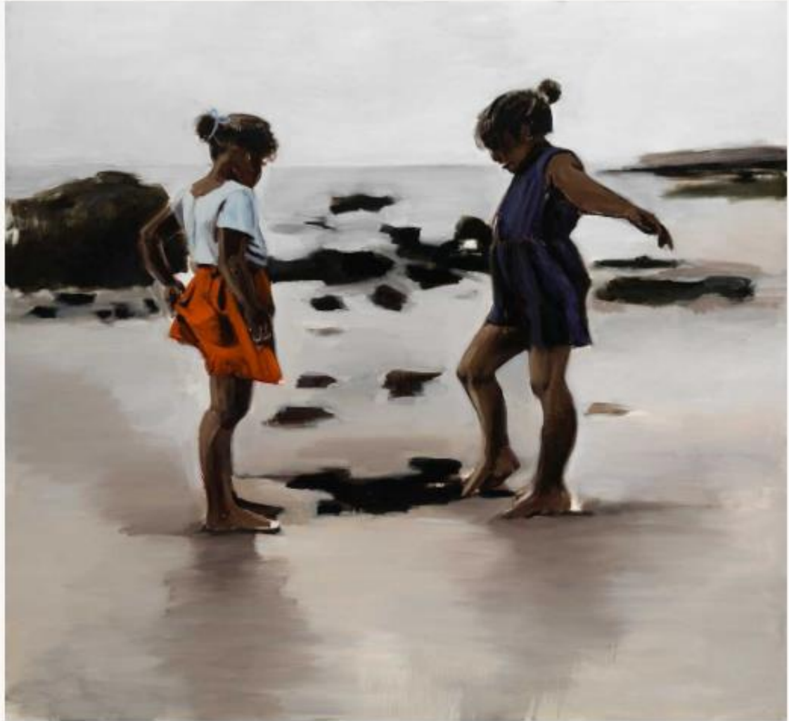
Lynette Yiadom-Boakye Condor And The Mole , 2011

SHE DOESN'T SPEND TOO LONG ON ANY OF HER CANVASES. IN FACT, SHE WORKS SO QUICKLY THAT SHE FINISHES SOME OF THEM IN A SINGLE DAY. HER FAVOURITE PAINT TO USE IS OIL PAINT. OIL PAINT IS A TRADITIONAL PAINT THAT TAKES A LONG TIME TO DRY. SHE SAYS: "IT'S JUST VERY DIRTY, IT'S VERY MESSY; IT DOESN'T ALWAYS DO WHAT YOU WANT IT TO DO."